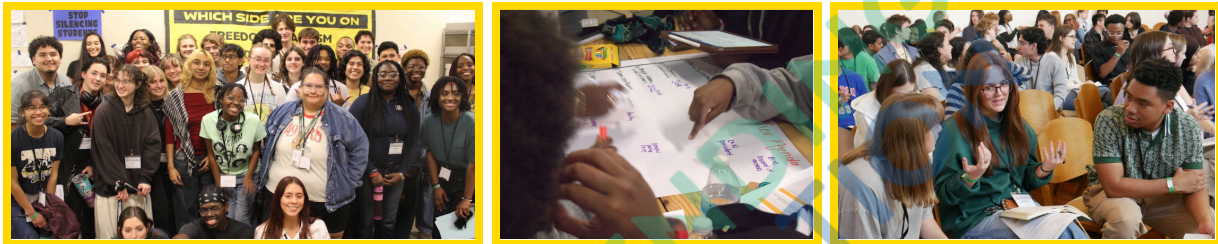
Images: Students in January 2026 planning to organize their campuses for May Day 2026.

We live in a moment where millions of people will take action for the first time. Our job is to bring new people to the movement, give them something meaningful to do with their outrage, and turn one-time protest into long-term action.