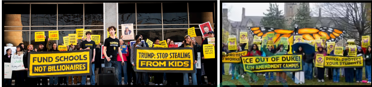
Students protest the defunding of the Department of Education; students and workers at Duke University demand justice for campus workers targeted by ICE and their campus administrators.

We can't plan for everything. There will be moments - trigger moments - that force us to respond to new crises and suddenly spark masses of new people into action. When ICE murdered Renee Good and Keith Porter Jr., millions of people suddenly protested and walked out of school nationwide. No one could have predicted this specific tragedy – but we could have predicted that the scale and violence of Trump's ICE would spark mass outrage.