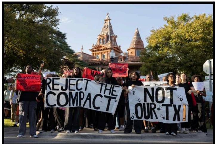
Students in Minneapolis walk out in January 2026. Students at UT Austin reject Trump's college demands letter in October 2025