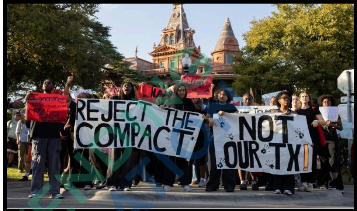
Students in Minneapolis walk out in January 2026. UT Austin students reject Trump's anti-immigrant demands in October 2025.

Step 3: Walk Out! Pass out flyers as students walk into classes the morning of your walkout.