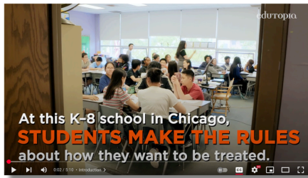
Social Contracts Foster Community