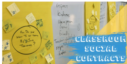
Setting Norms: A Social Contract