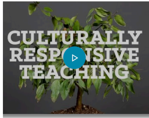
Culturally Responsive Teaching