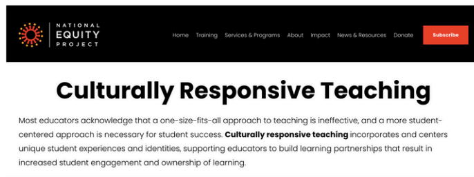
NEP Culturally Responsive Teaching