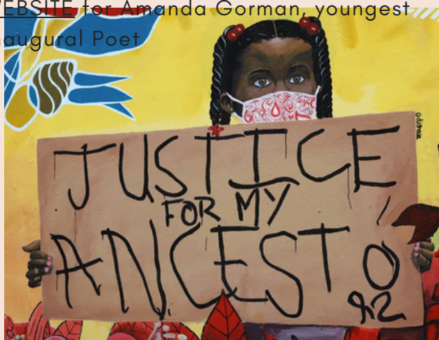
Bay Area Mural Program