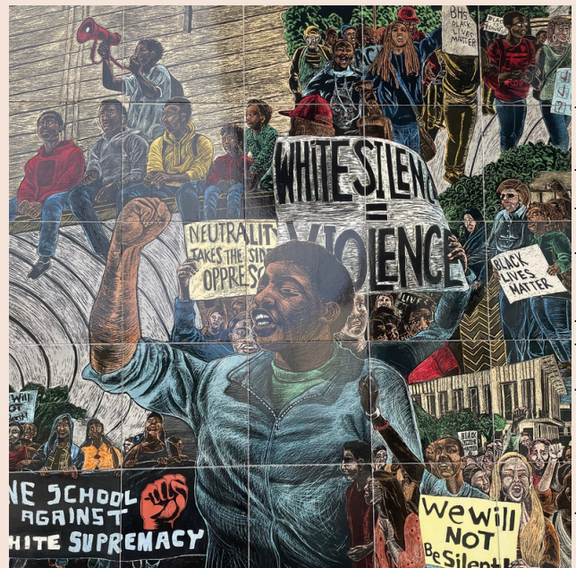
Student-created Berkeley High School mural