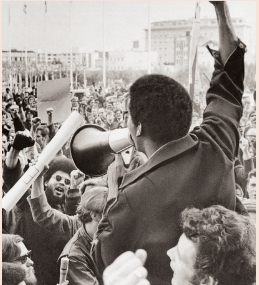
Black Student Union students at SF State & UC Berkeley sparked the 1968 movement for Ethnic Studies in the Bay Area