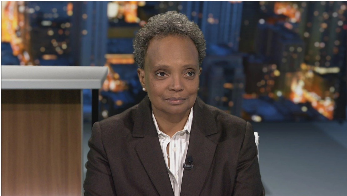
Mayor Lori Lightfoot appears on "Chicago Tonight" on Jan. 3, 2023.

Heather Cherone | January 11, 2023 5:01 pm