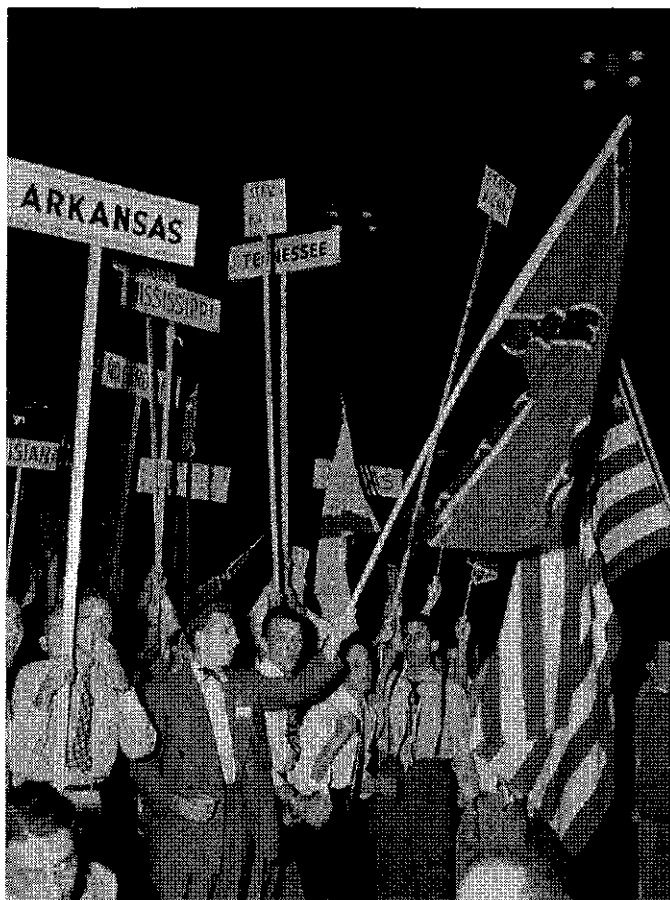
Southern college students at the Southern Democratic Convention in 1848, the year that segregationists began to break with the national Democratic Party over civil rights.

slaveholding planter class would witness the rise of an organized movement to stop the expansion of slavery and curb the power enslavers held over key institutions like the Senate and the Supreme Court.