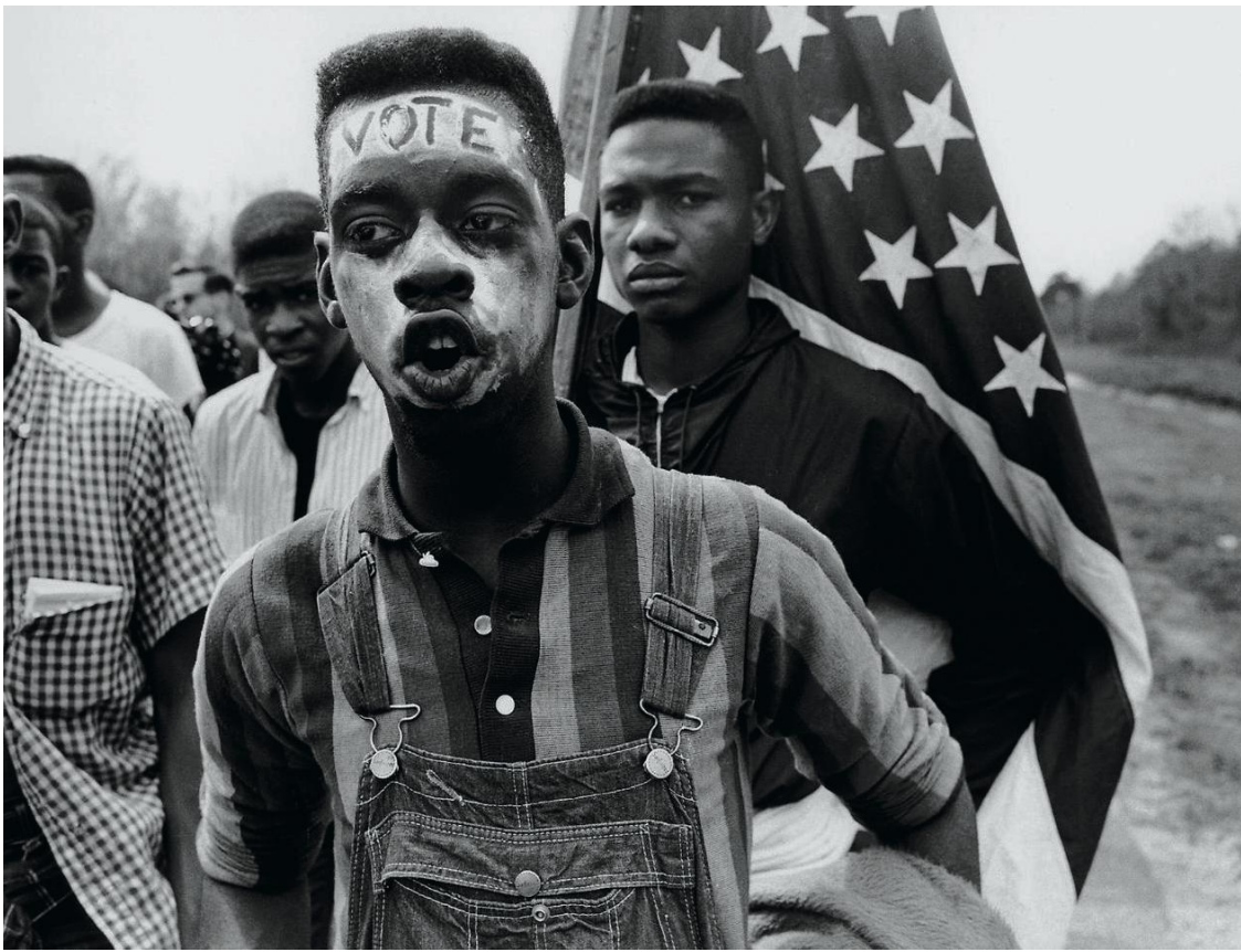
A demonstrator at the 1965 march from Selma to Montgomery, led by the Rev. Dr. Martin Luther King Jr. to fight for black suffrage.

volunteers for the war, was forced to reconsider his opposition to allowing black Americans to fight for their own liberation. The president was weighing a proclamation that threatened to emancipate all enslaved people in the states that had seceded from the Union if the states did not end the rebellion. The proclamation would also allow the formerly enslaved to join the Union army and fight against their former “masters.” But Lincoln worried about what the consequences of this radical step would be. Like many white Americans, he opposed slavery as a cruel system at odds with American ideals, but he also opposed black equality. He believed that free black people were a “troublesome presence” incompatible with a democracy intended only for white people. “Free them, and make them politically and socially our equals?” he had said four years earlier. “My own feelings will not admit of this; and if mine would, we well know that those of the great mass of white people will not.”