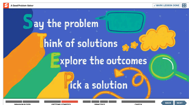
Grade 4, Unit 4, Lesson 16, A Good Problem-Solver